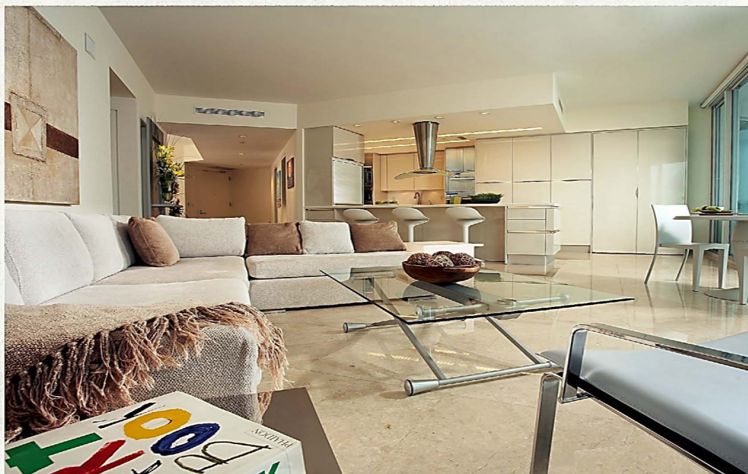
A CLEAR DIFFERENCE: Liliana Korn Custy designed this condo living room with a clean, contemporary look that is not sterile.